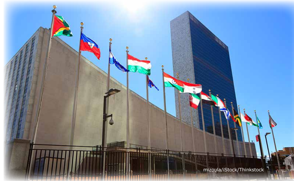
▲ The United Nations is headquartered in New York and includes 193 member states.

Local laws are created by legislators in cities, counties, towns, and villages. Examples include laws regarding rent and safety.