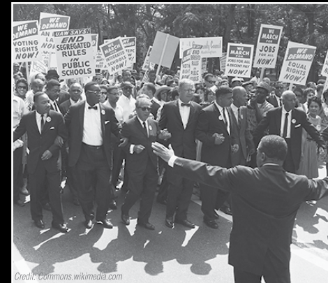
Enacting social change